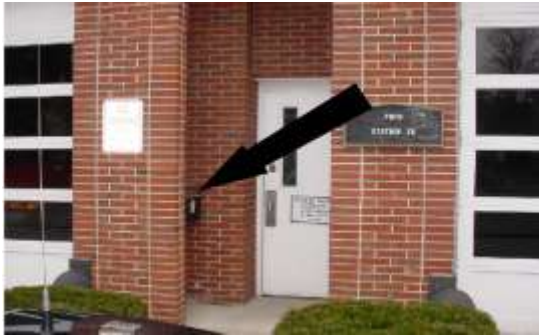
Drop Box Location

DROP BOX: Use the drop box for your water readings and tax payments in order to save postage.